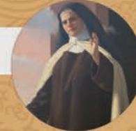
St. Thérèse of Lisieux