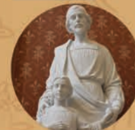
St. Joseph and Jesus