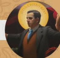
Bl. Miguel Agustín Pro