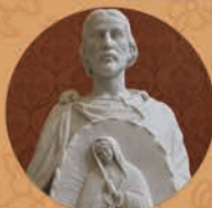
St. Juan Diego