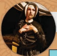
St. Faustina Kowalska