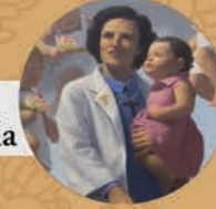
St. Gianna Beretta Molla