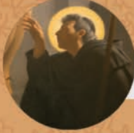
St. Peregrine Laziosi