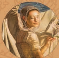
St. Maria Goretti